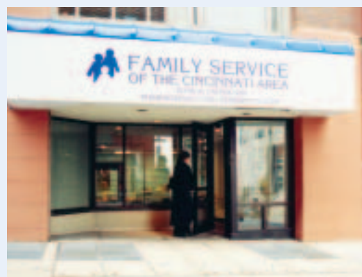
Family Service's new McFarland Center houses the International Family Resource Center and the downtown clinical counseling office.

The new facility includes four sizeable classrooms, a library/computer room, meeting rooms, and administrative offices. Visitors will be able to view displays in each of the classrooms to promote the agency's services and to highlight the experiences and successes of clients who have been served.