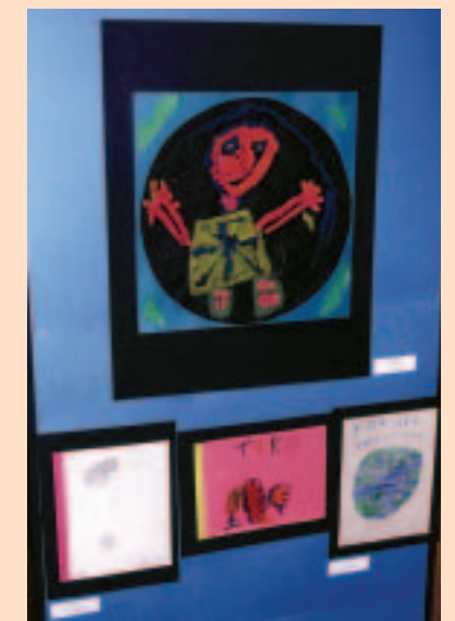
Art from some of the children at Friends place.

Classes are offered on a sliding scale fee structure based on income and family size. To register, please call (513) 345-8555.