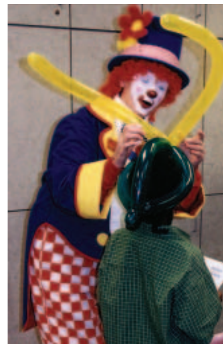
A clown entertains a child at the ceremony.