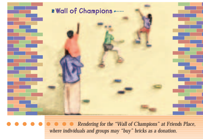
Rendering for the “Wall of Champions” at Friends Place, where individuals and groups may “buy” bricks as a donation.

Friends of the Children Cincinnati is funded through support from Hamilton County, the United Way, and by charitable gifts from individuals, corporations, and foundations. Currently underway is a Wall of Champions campaign,