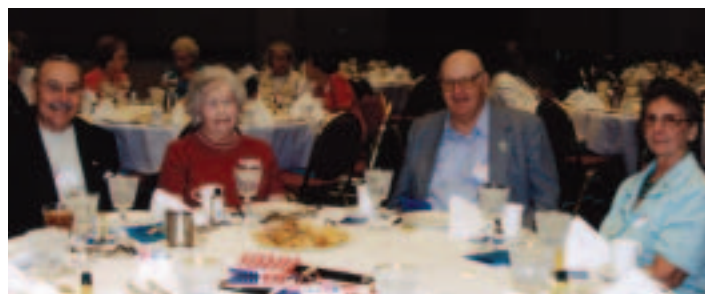
• • • • • Guests enjoyed both the high tea and one another's company.