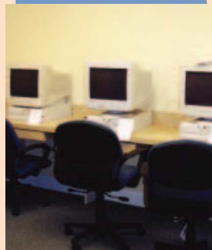
The study is equipped with computers and reference materials to help children with their homework and with enrichment projects and hobbies.