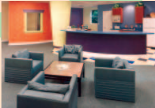
The cozy multipurpose room is a place to play games, relax, talk, and explore arts and crafts.