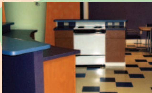
The fully-equipped kitchen will help children develop life skills such as cooking and managing a home.