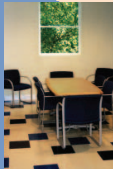
The dining room will give children a place to enjoy the nutritious food they've prepared, as well as an opportunity to learn and practice table manners and conversation skills.

Thanks to the KnowledgeWorks Foundation for funding the evaluation of this program.